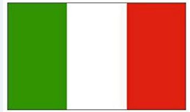
GasPT user: Italy's leading company in the transport and dispatching of natural gas.

POTENTIAL DEPLOYMENT: UP TO 7,000 DEVICES